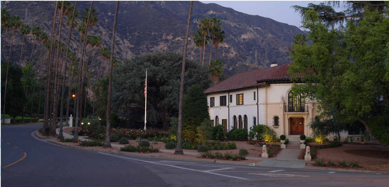
Residential neighborhood in Altadena, CA, along Mendocino Lane.

The UCLA Latino Policy and Politics Institute and the Center for Neighborhood Knowledge acknowledge the Gabrielino Tongva peoples as the traditional land caretakers of Tovaangar (the Los Angeles basin and So. Channel Islands). As a land grant institution, we pay our respects to the Honuukvetam (Ancestors), 'Ahihirom (Elders), and 'Eyoohiinkem (our relatives nations) past, present, and emerging.