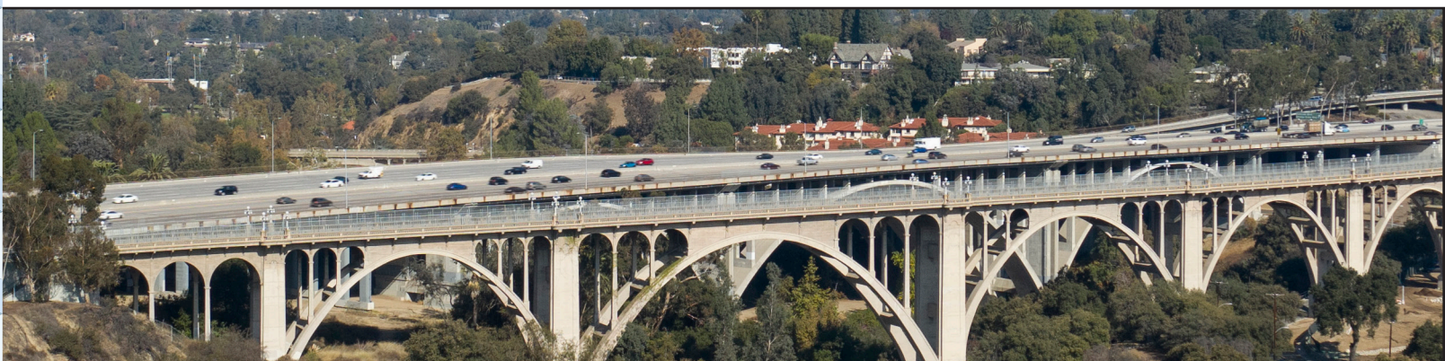
View of Pasadena and Altadena overlooking the Colorado Bridge and 134 Freeway.

Losing access to school during and after the fire put many of these children in precarious situations. Today, two of Altadena's five schools sit within the fire's burn zone, while an additional two lie at its edge and were susceptible to smoke damage. Collectively, these schools enrolled 1,719 students in the 2023-24 school year. 18 Whether the fires damaged their schools or their homes, students and their families are now being forced to navigate new systems, increasing the risk that they and their families will fall through the cracks during recovery.