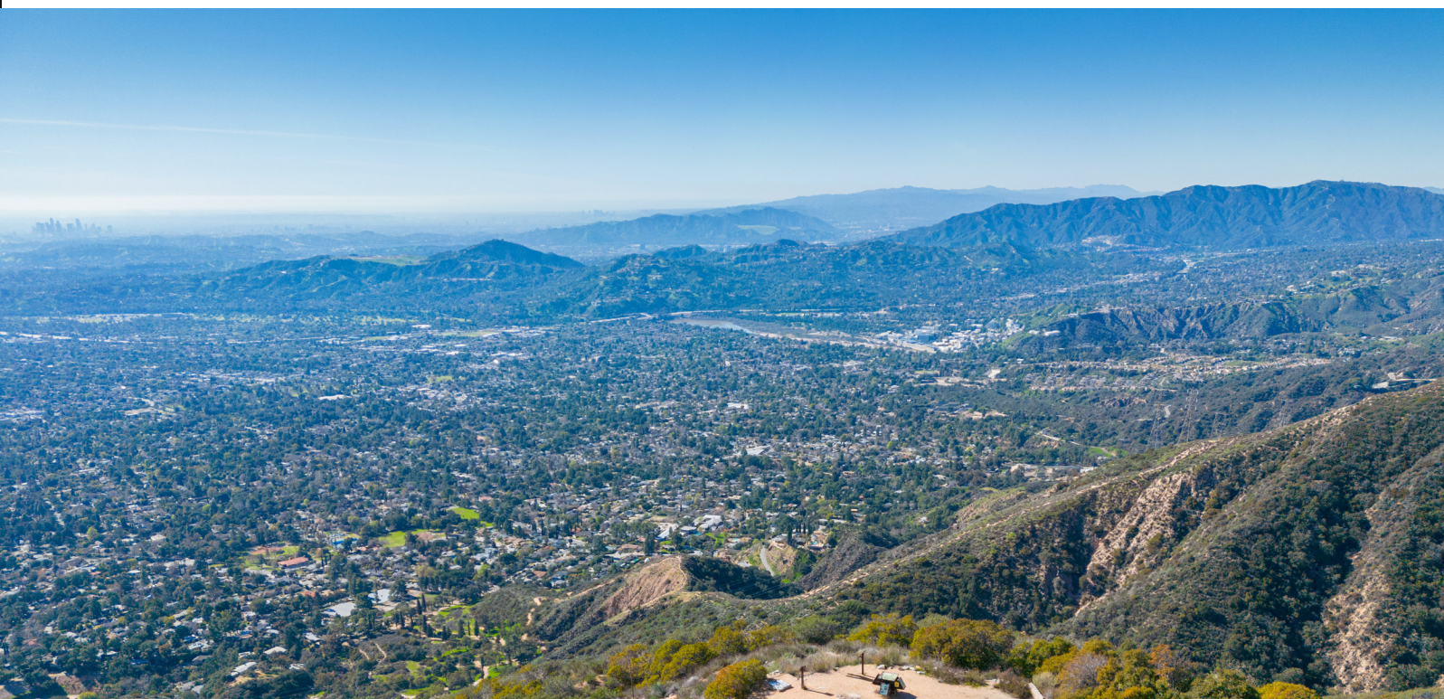
View from the Echo Mountain Ruins of Los Angeles and the San Gabriel Valley.

In 2019-23, more than 7,000 Altadena residents—about one in six (18%)—had incomes below twice the Federal Poverty Line (FPL) , the benchmark commonly used to determine eligibility for many public safety net programs. 6 Additionally, over 3,000 Altadena residents (7%) lived below the FPL . The income threshold for living below the FPL varies by family size and is adjusted for inflation annually but was $30,000 in 2019-23 for a family of four. 7 The households below the FPL were among the ones facing the most economic pressure when disaster struck.