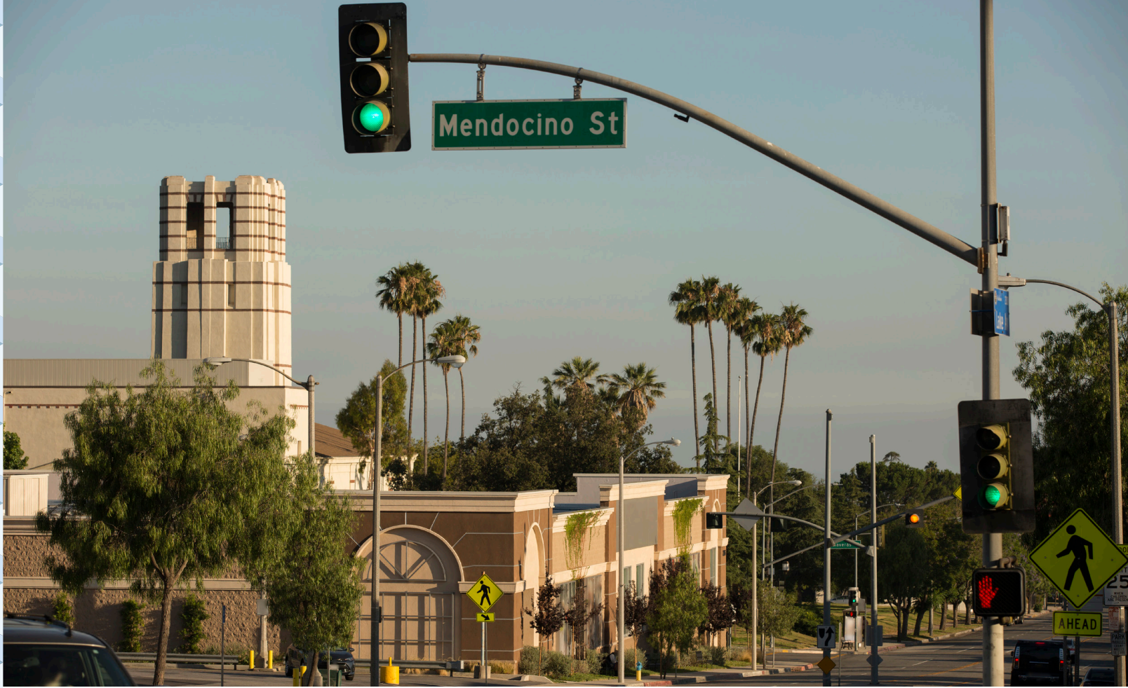
Intersection at Mendocino Street in downtown Altadena.