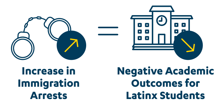
Figure 1. Declines in Educational Outcomes With Increases in Immigration Arrests

It raised the probability of repeating a grade for children of "likely unauthorized immigrants" aged 6 to 13 years by 14% and the likelihood of dropping out for young people aged 14 to 17 by 18% (Amuedo-Dorantes and Lopez, 2017). Sattin-Bajaj and Kirksey (2022) along with other colleagues found that increased arrests of immigrants related to a decline in English Language Arts (ELA) scores for secondary Latinx English Learners (ELs) roughly equivalent to one month of learning loss (Sattin-Bajaj & Kirksey, 2022). They also found that increased immigration enforcement led to declines in math test scores, sense of belonging and safety and bullying for all Latinx secondary students in their sample (not just ELs). In addition, absenteeism rates worsened by about 5 percentage points in areas where immigration arrests occurred (Kirksey & Sattin-Bajaj, 2021). The true scope of the academic impact will be a major concern for years to come, especially when compounded by the complexity of the COVID pandemic and its impact on schools, students, and families.